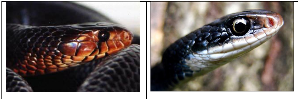
Figure 1. Eastern indigo snake (left photo) and a southern black racer (right photo) showing identification field marks. Throughout much of its range, eastern indigo snakes show coral or reddish brown lower mandible and throat. Black racers have a creamy or white lower mandible and throat. Areas around the eye are always dark in adult black racers.

mistaken for an eastern indigo snake. Within the geographic range of the eastern indigo snake all other plain black snakes have smooth scales, a divided anal plate or both. The black racer's scales are smooth and dull black, and the anal scale is divided. The black racer is a much more slender snake than the indigo, and often the chin and throat of the racer are creamy white in color. Young racers are strongly patterned with a mid-dorsal row of dark gray, brown or reddish brown blotches on a gray or bluish gray ground color. The patterns become less distinct as the individual matures (Wright and Wright 1957).